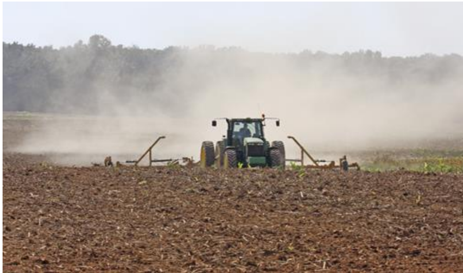
Cooperative Farming at Wheeler National Wildlife Refuge