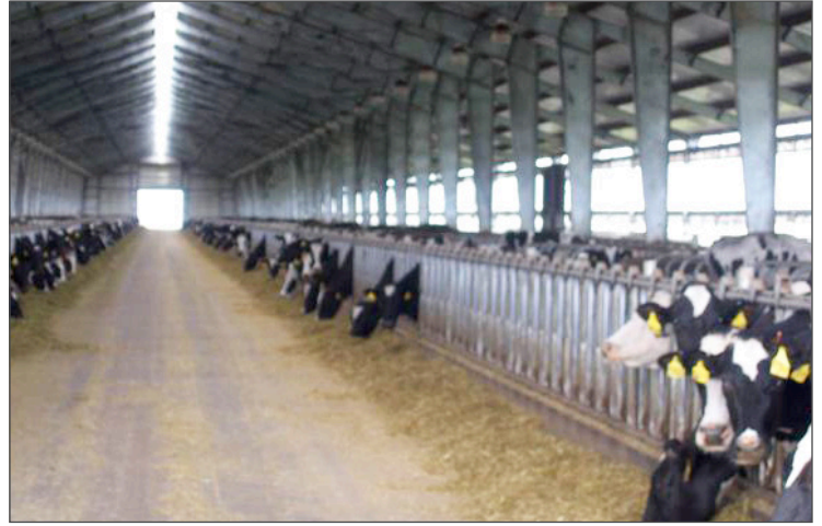
Dairy cattle are fed nutrient dense diets to increase milk production. The rich diets lead to an increase in the amount of gases emitted by each cow, which can contribute to global warming.

Large dairy CAFOs have the potential to threaten entire communities. One 1,500-cow dairy in Minnesota re-