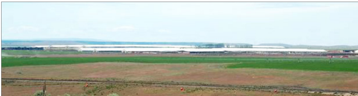
The Threemile Canyon Farm complex where massive barns contain tens of thousands of cattle.