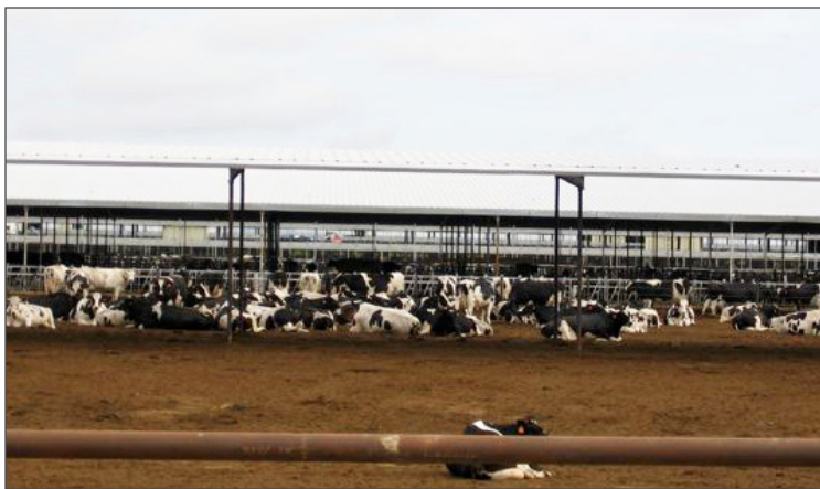
Gestating milk cows loaf on dirt lots before being moved into the dairy operation for milking once they have had their calves. Cows in these operations do not have the opportunity to graze on pasture.

the United States, and manure management is the fastest growing major source of methane, increasing by more than 50 percent between 1990 and 2008. 34