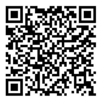
Figure 1: Sample QR Code Linking QR Code Definition

conditions at this time." 83 Fed. Reg. at 65,828 (emphasis added). Instead, to "remedy" the failings the Congressionally mandated study found, USDA provided phone text message disclosures as a separate option. 83 Fed. Reg. at 65,828–29; see 7 C.F.R. § 66.108 (phone text message option); § 66.100(b)(1)–(4) (adding phone text message option to other options of on-package text, on-package symbol, and electronic or digital). That is, USDA still allowed companies to use QR codes alone.