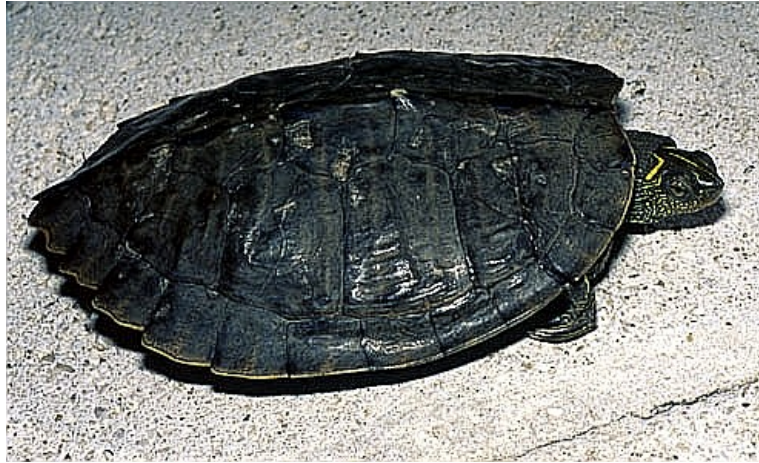
False map turtle ( Gratemys pseudogeographica )

BEFORE THE OKLAHOMA WILDLIFE CONSERVATION COMMISSION, GOVERNOR OF OKLAHOMA, AND THE OKLAHOMA DEPARTMENT OF ENVIRONMENTAL QUALITY